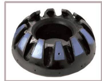
Shaffer® style Spherical Packing Element

O.E.M. Part Numbers are for reference only. Titan is not affiliated with any OEM.